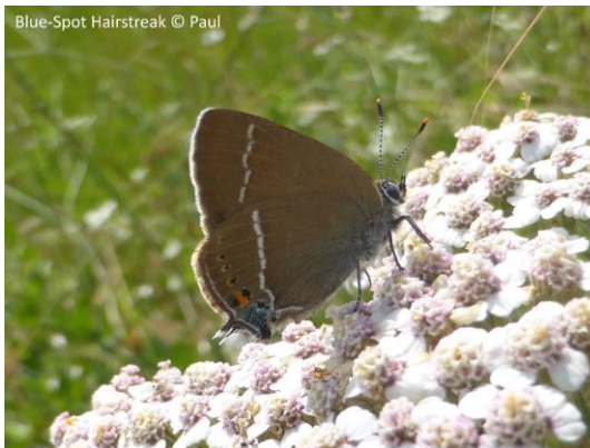
Blue-spot Hairstreak

The first stop was along a road, where a large colony of Bee-eaters are known to breed. They put on a fabulous display for us, a delight to see so many of this most colourful of European birds.