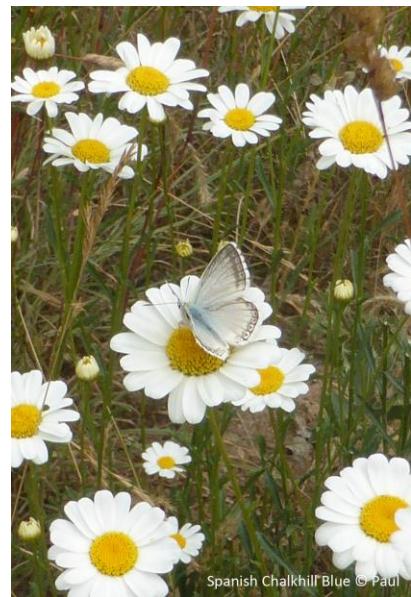
Spanish Chalkhill Blue

Doing our daily list at the hotel before dinner in the evening, the group total for the day was 57 butterfly species, a fantastic number, taking us to 61 species so far.