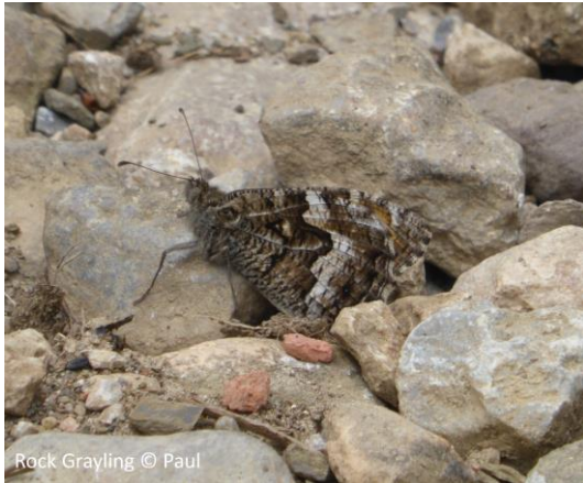
Rock Grayling

Brown Argus Aricia cramera , Turquoise Blue Polyommatus dorylas , Silver-washed Fritillary Argynnis paphia , High Brown Fritillary Fabriciana adippe , Piedmont Ringlet Erebia meolans , Rock Grayling Hipparchia alcyone , Grayling Hipparchia semele , and Great Banded Grayling Brintesia circe .